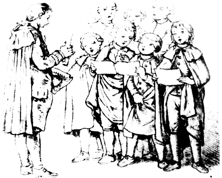
Boys from the Thomasschule, Leipzig, singing out of doors: drawing by Ludwig Richter (1803-1884), from W. Hitzig, Johann Sebastian Bach 1685-1750: sein Leben in Bildern (Leipzig, 1935), pl.30